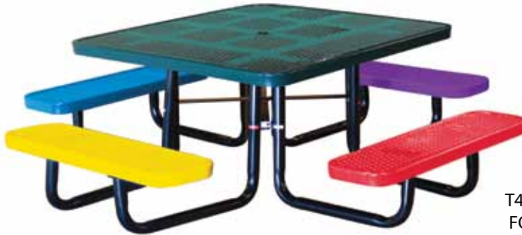
T46SQP-CHILD-PERF FOR SHOW OLNY