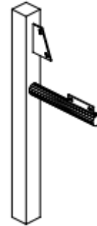
(B) BENCH FRAME W/BACK