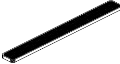
(A) 8' RC SEAT