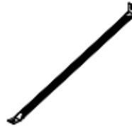
(B) BENCH FRAME