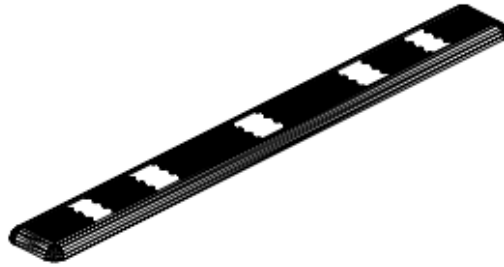
(A) 8' PERF SEAT