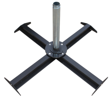
A. Cross Base