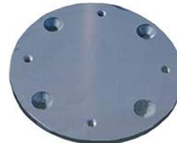
B. BASE PLATE