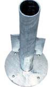
C. IN-GROUND FITTING

INCLUDED WITH UMBRELLA CAN BE BOLTED DIRECTLY TO CONCRETE SLAB OR WOODEN DECK