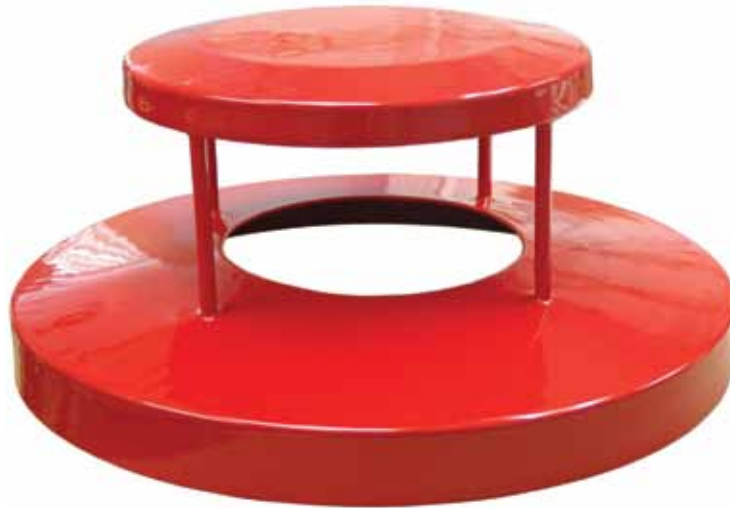
bottom / top view